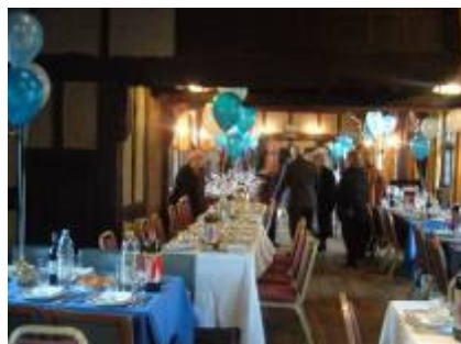
Guests arrive at the brightly decorated hall