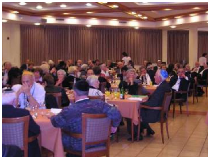
The banquet for the 2006 Combined Installation was held at Protea Village, Netanya